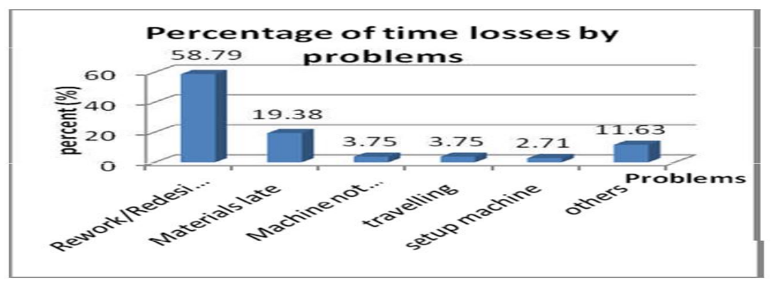
Figure 1: Percentages of Time Losses by Problems

Data already collected before started kaizen steps. From counter measure are proposed in why-why analysis, each current procedures of sales order processing flow are studied.