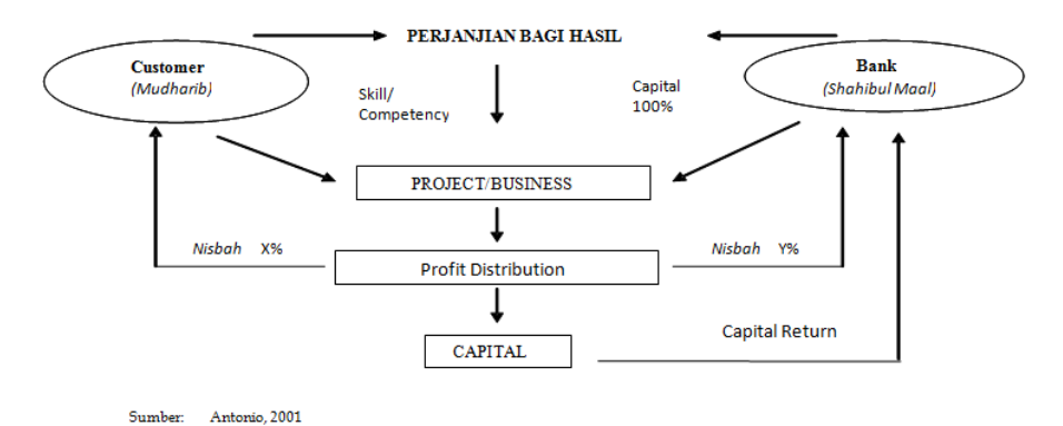
Figure 2.1 Scheme of al-Mudharabah

Al-mudaraba banking applications, especially in its application in the financing is generally described in the following scheme (Antonio, 2001):