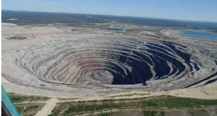
Figure 2: Mining Method by Bench