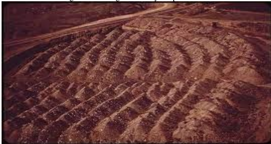
Figure 3: Mining Method by Strips or Slices