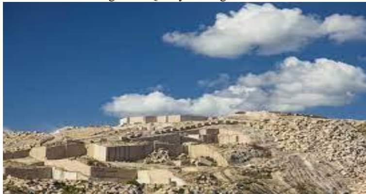
Figure 4: Quarry Mining Method