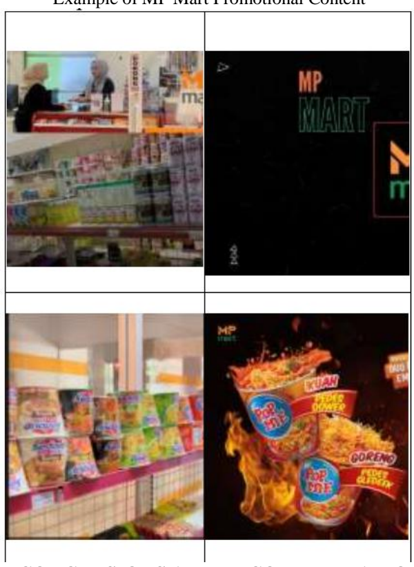
Table 2 Example of MP Mart Promotional Content