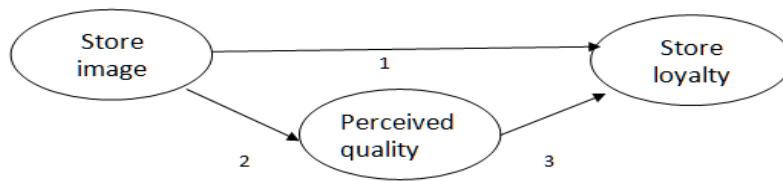
Figure 1. Conceptual Framework