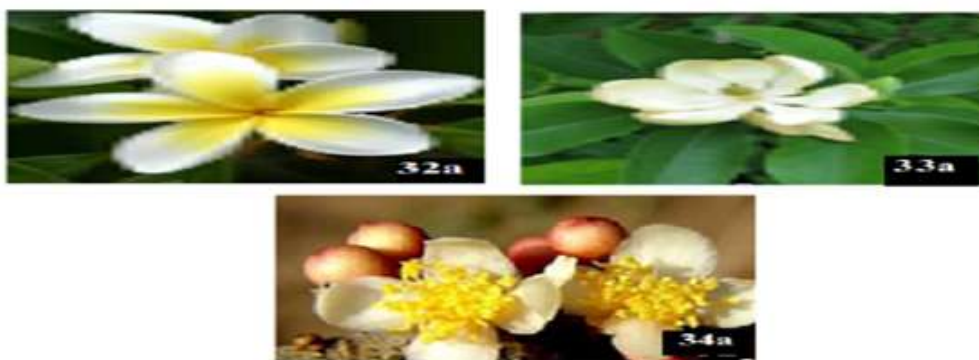
32. Chafa (32a. flowers) 33. Kavathichafa (33a. flower) 34. Suranga (34a. flowers)