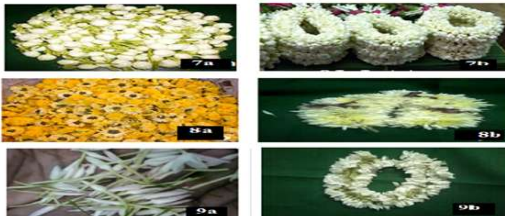
7. Mogra(7a. flowers,7b. garland)