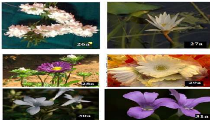
26. Anant(26a. garland) 27. Salak (27a. flower)