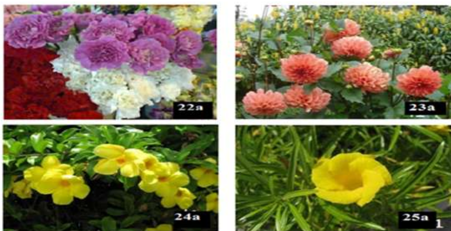
22. Carnations ( 22a. Flowers) 23. Dahlia (23a. Flowers)